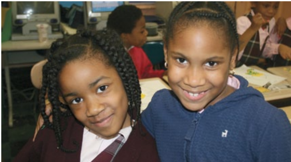
Students at Gary Klinsky Children's Center at P.S. 91.

BCS BELIEVES THAT EVERY CHILD HAS THE POTENTIAL TO ACHIEVE GREAT SUCCESS IN LIFE WHEN THEY'RE GIVEN THE APPROPRIATE SUPPORT. We are proud to offer programs for children and young adults between the ages of 0 and 21. We also know that the younger we can reach children, the greater the impact we can have in the life of the child, and the vitality of our community. Our programs for children and youth primarily target historically underserved, low-income and at-risk communities. We have a strong tradition of educational enrichment in all of our programs. From our family daycare program to our transfer high school, we offer curricula that challenge, stimulate and inspire.