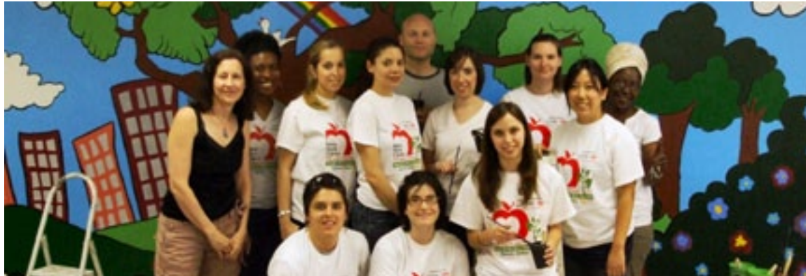
Above: The finished product: the cheerful view upon entering the center.