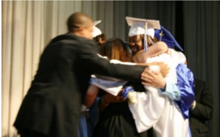
Above: Students from the first graduating class of 2009 participate in a moving ceremony.

THERE ARE 140,000 OVER-AGE AND UNDER-CREDITED STUDENTS AT RISK OF DROPPING OUT IN NYC. In September 2008 we opened the doors to our new transfer high school, BCS Brooklyn High School for Leadership and Community Service. Nestled in Clinton Hill, this school is a collaborative venture between BCS, New Visions for Public Schools and the Bill and Melinda Gates Foundation. Our school gives 200 over-age and under-credited young adults between the ages of 17 and 21 the opportunity to earn their Regents diploma in a supportive and nurturing environment. In addition to a rigorous curriculum, we provide full-time advocacy counselors who help students and their families achieve their goals. With a fundamental culture of leadership and service to community, this program has already proven itself a success. In June 2010, 40 students graduated; all the graduates have applied to, or are already attending college.