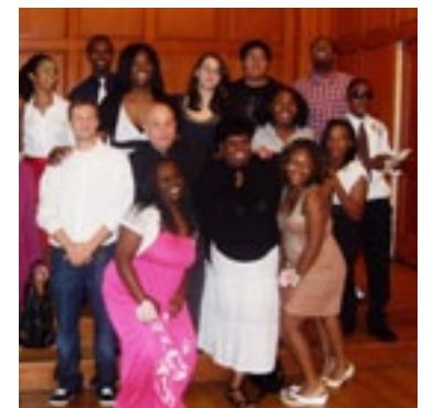
Above: Students and BCS staff at the 2010 AEEP graduation ceremony

an additional focus on employment training such as medical billing and retail. This will give our students, who struggle both academically and emotionally, greater opportunities for employment after completing their GEDs. Between 2008 and 2009, 15 out of 26 AEEP students who were placed in internships continued on to obtain paid employment.