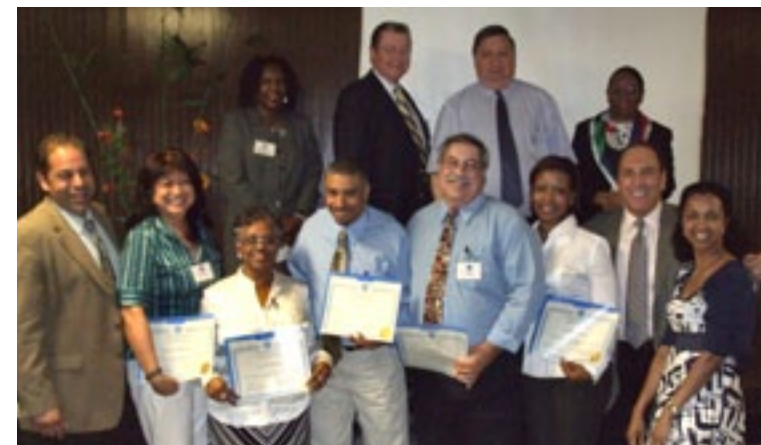
Above: Members of the Business Advisory are honored for their own contributions to BCS

THE BCS BUSINESS ADVISORY COUNCIL (BAC) WAS ESTABLISHED IN 1991 TO SUPPORT THE AGENCY'S EFFORTS TO SECURE JOB TRAINING AND JOB PLACEMENTS FOR DISABLED BCS CLIENTS. The BAC acts as a liaison to the business community. They play an active role in helping identify potential job sites, and market our highly skilled and cost effective services to the business community. The BAC annually recognizes clients for their achievements. In 2010, the BAC recognized 146 clients who maintained their jobs for one year or more. Some of those honored have been at the same job for over 15 years!