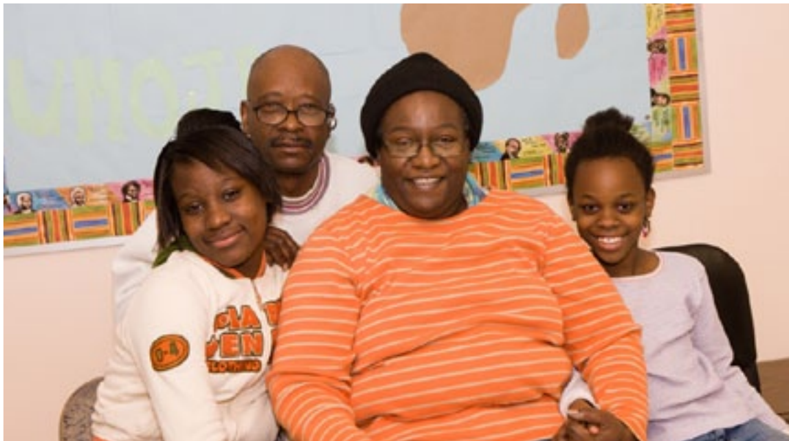
A family receives services at the BCS Bed-Stuy Family Center.

689 FAMILIES AND 1,096 CHILDREN MADE STRONGER THROUGH BCS FAMILY PROGRAMS